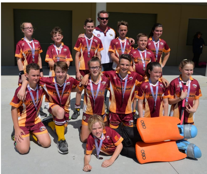
Presentation for after the match