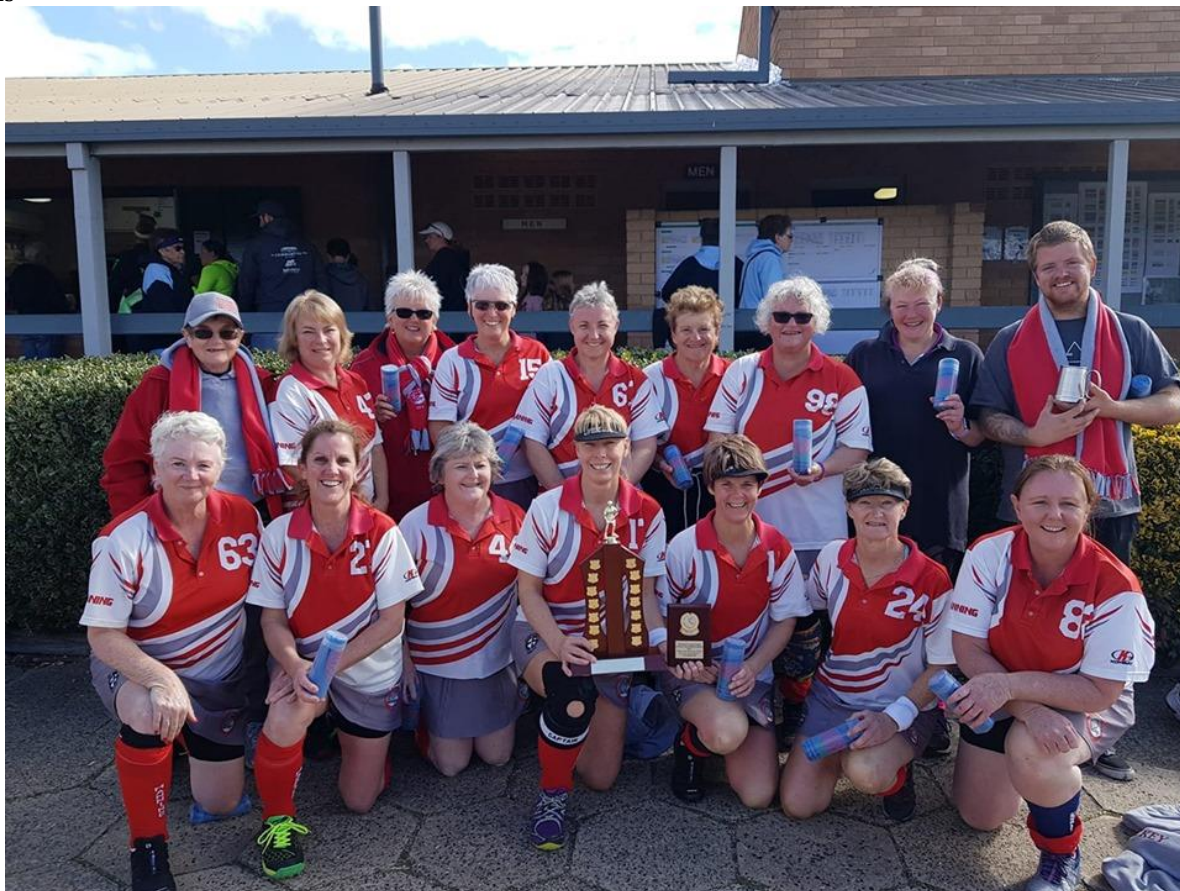
MANNING VALLEY HOCKEY ASSOCIATION OVER 50'S MASTERS REPRESENTATIVE TEAM- 2019 STATE CHAMPIONS

The Association congratulates our MVHA Womens Masters Over 50's State Champions and our Over 40's Team who are Div One State Champions