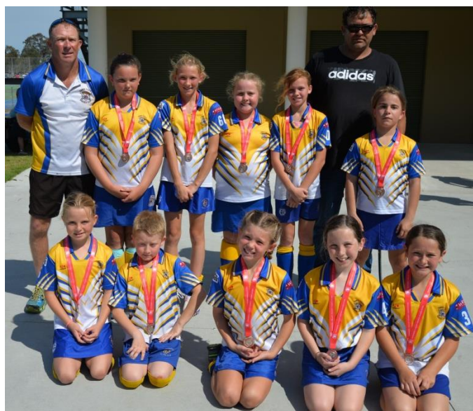
Runner Ups Taree West

Junior Under 11 Mixed Teams: Tigers Gold Taree West TLF Premiers Tigers