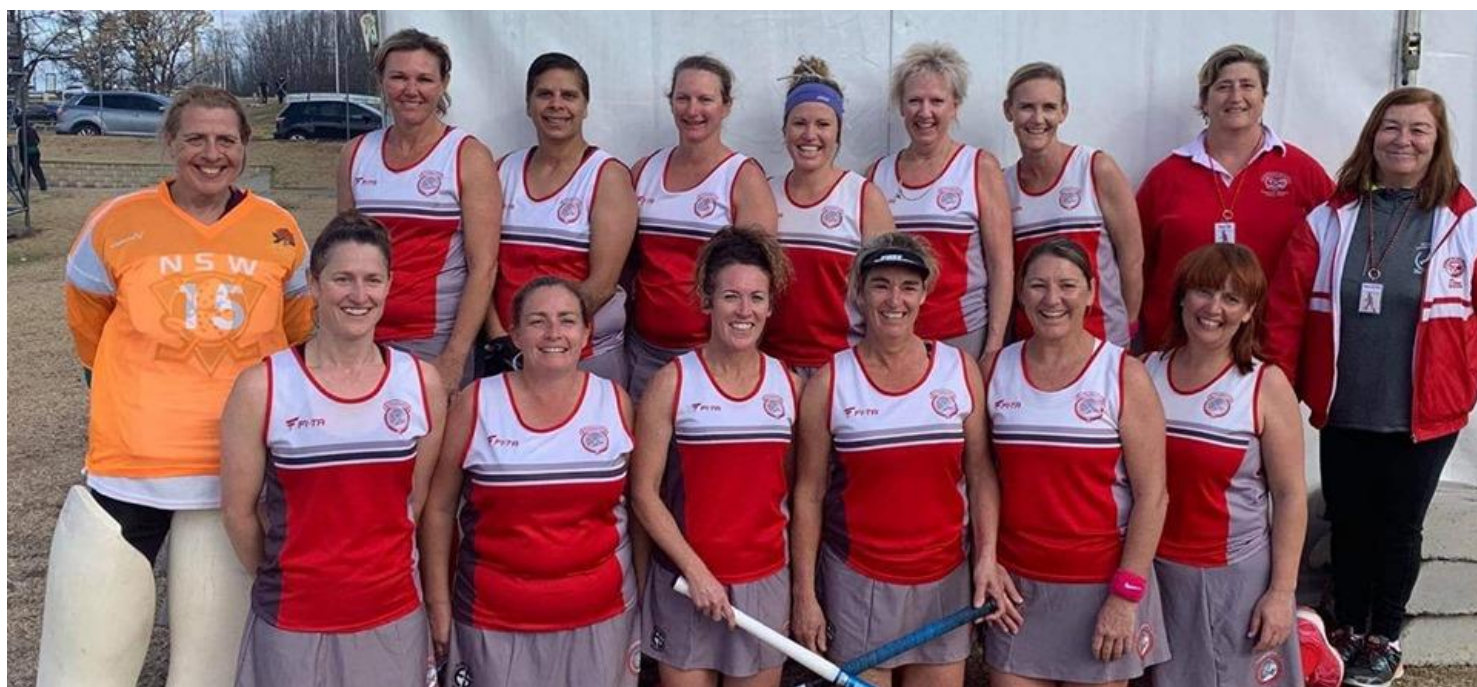
MANNING VALLEY HOCKEY ASSOCIATION OVER 40'S MASTERS REPRESENTATIVE TEAM- 2019 STATE CHAMPIONS