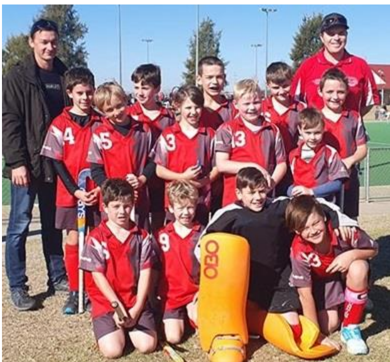
Jinks came second in Boys York Cup Div B 2019